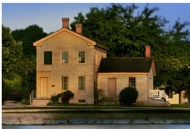
1850 William Beith House , home to Preservation Partners of the Fox Valley.

The mission of Preservation Partners is to offer heritage education and to promote the appreciation and preservation of the Fox Valley's rich architectural and historical resources. We fulfill our mission through education at our historic sites and through fun annual events.