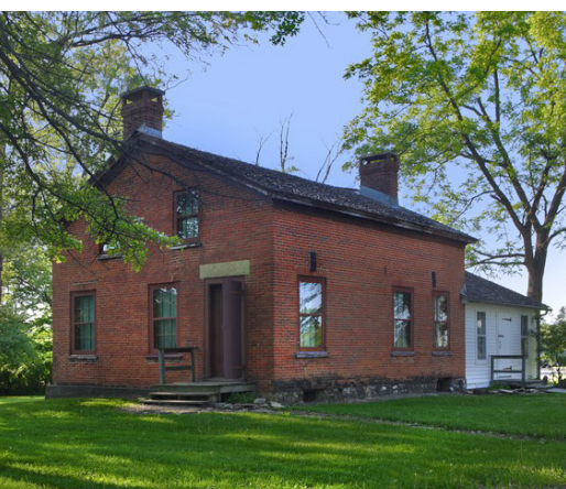
1843 Durant House Museum Museums at LeRoy Oakes Forest Preserve, managed by Preservation Partners