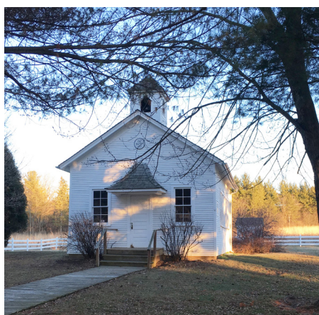
1872 Sholes School Museum Museums at LeRoy Oakes Forest Preserve, managed by Preservation Partners